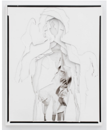
Justine Kurland Portraits (Negative Space) 2021 collage (hardcover) 10 1/2 x 8 1/2 inches