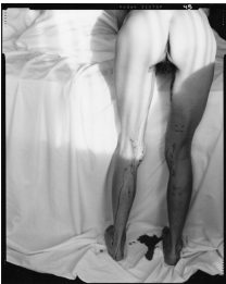
Justine Kurland Bleeding Out 2016 gelatin silver print 36 1/2 x 29 inches (92.7 x 73.7 cm)