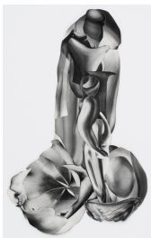
Justine Kurland Distortions 2021 collage (excerpt) 17 x 10 1/4 inches