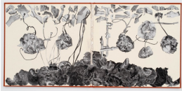
Justine Kurland Cray at Chippewa Falls 2021 collage (hardcover) 24 1/2 x 11 5/8 inches