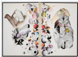
Justine Kurland Untitled (Pompidou) 2021 collage (hardcover) 12 1/8 x 17 inches