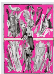
Justine Kurland Manequin 2021 collage (hardcover) 18 3/4 x 13 1/2 inches