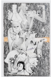
Justine Kurland Raised by Wolves 2021 collage (hardcover) 19 x 12 inches