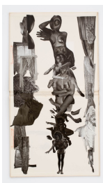
Justine Kurland East 100th Street 2021 collage (hardcover) 22 5/8 x 12 3/8 inches