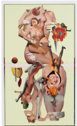
Justine Kurland Command Performance 2021 collage (hardcover) 19 5/8 x 11 1/2 inches