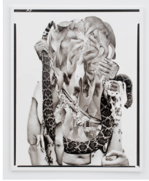
Justine Kurland Portraits (Additive Space) 2021 collage (hardcover) 10 1/2 x 8 1/2 inches