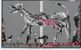
Justine Kurland Paris Les Halles Market 2021 collage (hardcover) 18 1/2 x 11 1/8 inches