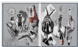
Justine Kurland Eleanor 2021 collage (hardcover) 12 1/4 x 21 inches