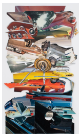
Justine Kurland Los Alamos Revisited 2021 collage (excerpt) 21 3/4 x 12 inches