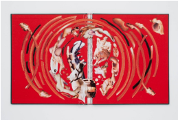
Justine Kurland Pictures from Home 2021 collage (hardcover) 18 7/8 x 10 7/8 inches