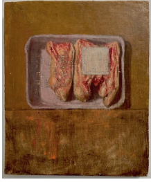
Bruce Kurland Untitled 2013 (unfinished) oil on panel 12 1/2 x 10 inches