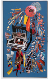
Justine Kurland New York in Color 2021 collage (hardcover) 20 3/8 x 11 3/4 inches